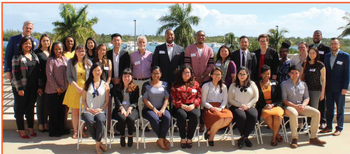
2019 SCCAP LEAD Fellows and speakers

The LEAD Institute's goal is to provide professional development, networking, and leadership skills for graduate students and early-career professionals from diverse groups.